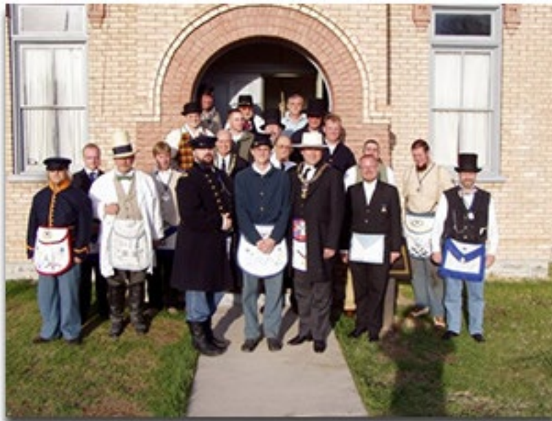
22 May 2008 Camp Floyd Historic School House