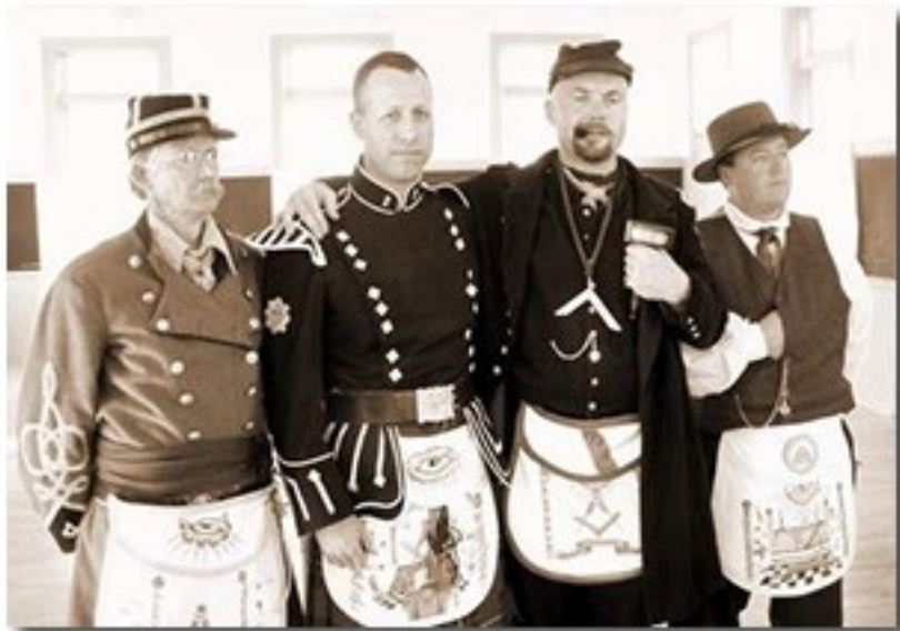
Members of Wasatch Lodge No. 1, 22 May 2004